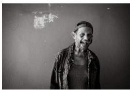
Photo 16 - moments of happiness: this man is on his way to see his girlfriend for their daily meeting, where they will dance to Jerry Lee Lewis, whose disc he has just bought. "Do you know Jerry Lee?"

The homeless are often victims of violence. This man was hit by