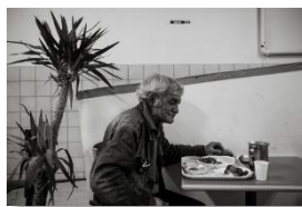
Photo 05 - While some residents are happy to get together to chat over meals, many prefer to stay alone and thus prolong the loneliness of the day.