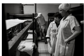
Photo 09 - The man in the bed is just back from a stay in hospital. The staff of Le Refuge can only watch as his health worsens rapidly.