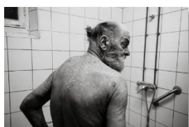
Photo 08 - Showers are not mandatory and the staff have to be very persuasive when needed. In this case, their insistence helped identify a case of an infectious skin disease.