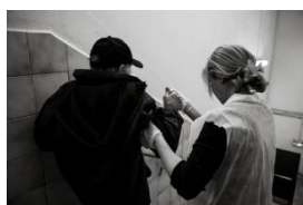
Photo 07 - This old man is led to a shower cubicle by a carer. Like others, he needs help to accomplish simple daily tasks (cleaning, eating, moving around)...