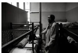
Photo 06 - Conflict is frequent in these confined spaces.