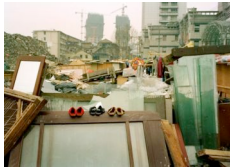
Photo 16 - Workers' slippers drying in the middle of the rubbles.