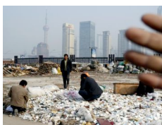
Photo 03 - Porcelain and glass recycling workers. Resell price is 10 cents of euro per kilo.