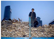
Photo 18 - Worker charging wood on the truck of a recycling company.