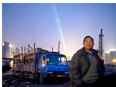
Photo 19 - Truck driver for a recycling company waiting the wood to be charged before driving it to the recycling factory in a province close to Shanghai.