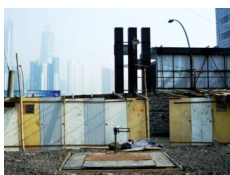
Photo 04 - Weighing machine and house of a worker. Workers pay a working fee from 100 euros until 1000 euros per month depending of the superficy. They earn around 120 euros per month.