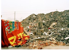
Photo 15 - Daily workers have no rights to come with their family and they are several people living in a cabin.