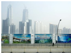
Photo 01 - By day : advertisements talking up the modernisation of the country...

Photographs by Boris SVARTZMAN Shanghai, China, January 2007