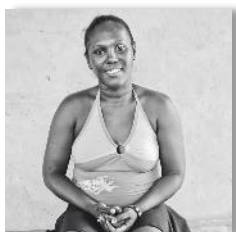
Photo 12 - "If you go to the hospital because you got hurt, and if they know that you have this disease, they can treat you just like a dog: put you in a corner. (...) Before tending to your injuries, they would put on four pairs of gloves!" Jennifer, 26, mother of 3 children.