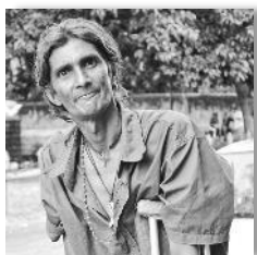
Photo 19 - "I take no medication at all. It's too complicated for me: to get up in the morning and swallow 5 pills, when you don't even eat properly..., it is not easy." Baby, 43, painter