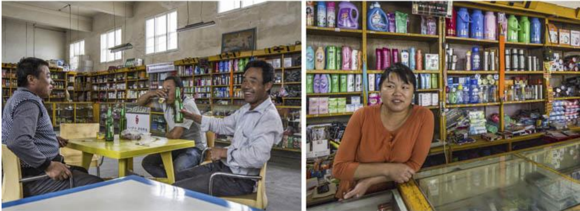
Diptyque 15 – On Sundays, the the men come to relax at Yumen’s grocery shop–café. The owner of the café is fairly happy with business.