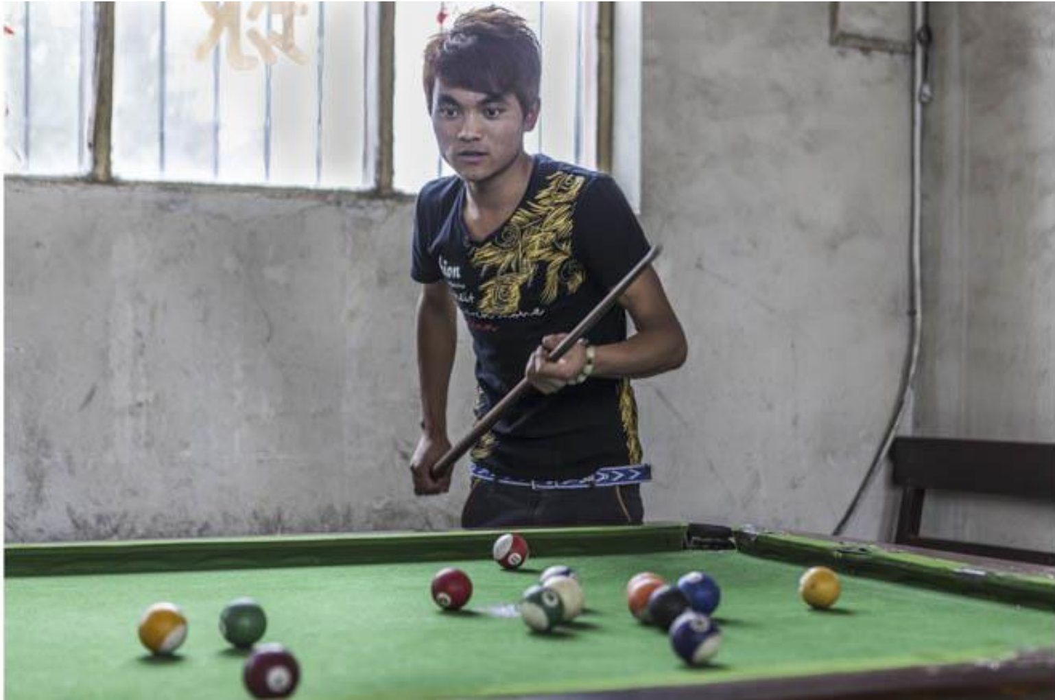
Photo 16 – A young man playing billiards in Yumen’s grocery store-café, the only place for amusement in this former oil town, abandoned by the Chinese authorities.