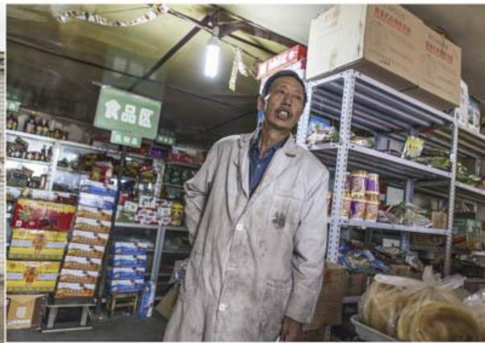
Diptyque 17 – A shopfront in the main street. Owner of a small grocery shop in Yumen.