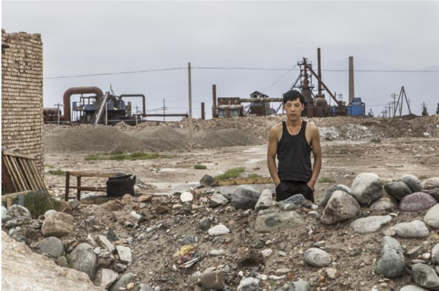
Photo 02 – A worker in the abandoned former oil drilling town of Yumen, in the Gobi desert. In the background is an abandoned cement factory.