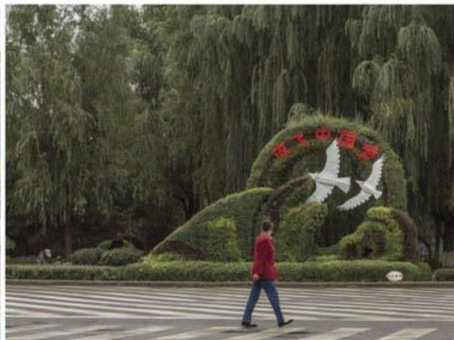
Diptyque 22 – Jiuquan. End of class at the college built for the children of Yumen's former oil workers. Inscription in Chinese: "The Chinese dream takes off" .