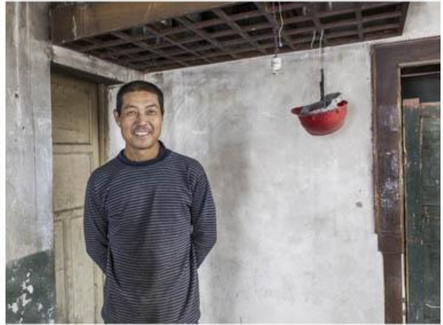
Diptyque 10 – A worker in his temporary dwelling in the abandoned town of Yumen.