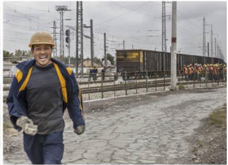
Diptyque 08— A worker running to join his colleagues unloading sacks of rocks from a train at Yumen station.