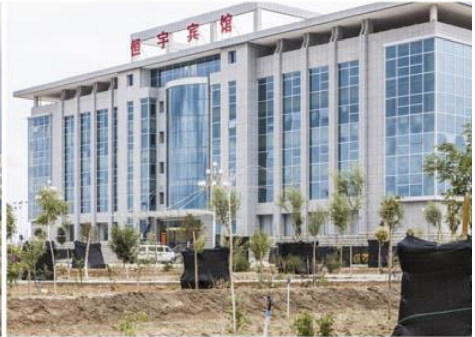
Diptyque 18 – On the outskirts of Yumen, new buildings whose construction seems to be suspended, and a new hotel under construction. This region of Gansu province is enjoying development thanks to the installation of wind farms and solar arrays.