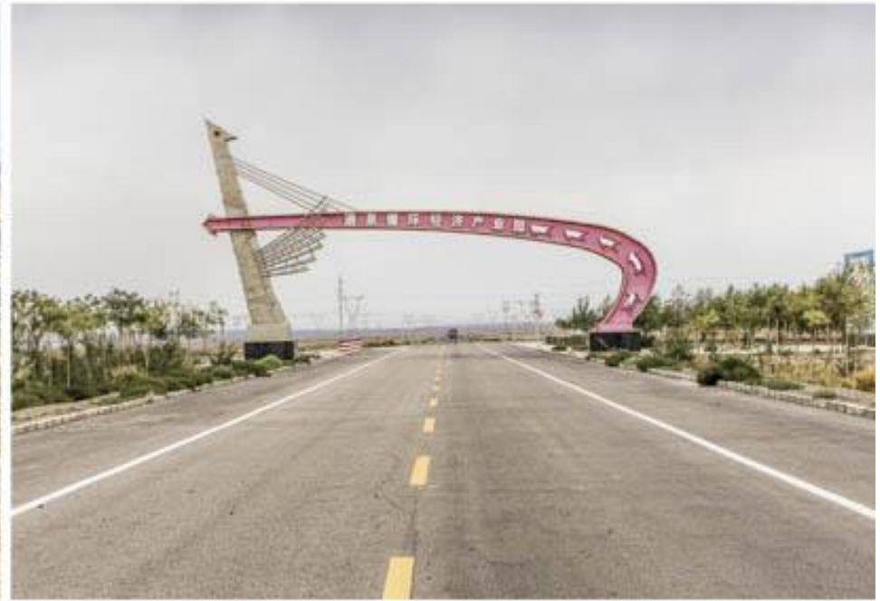
Dptyque 23 – Motorway and wind farm, Yumen district in the Gobi desert. Sculpture promoting sustainable development on the road leading to the wind farms and solar arrays close to Jiuquan.