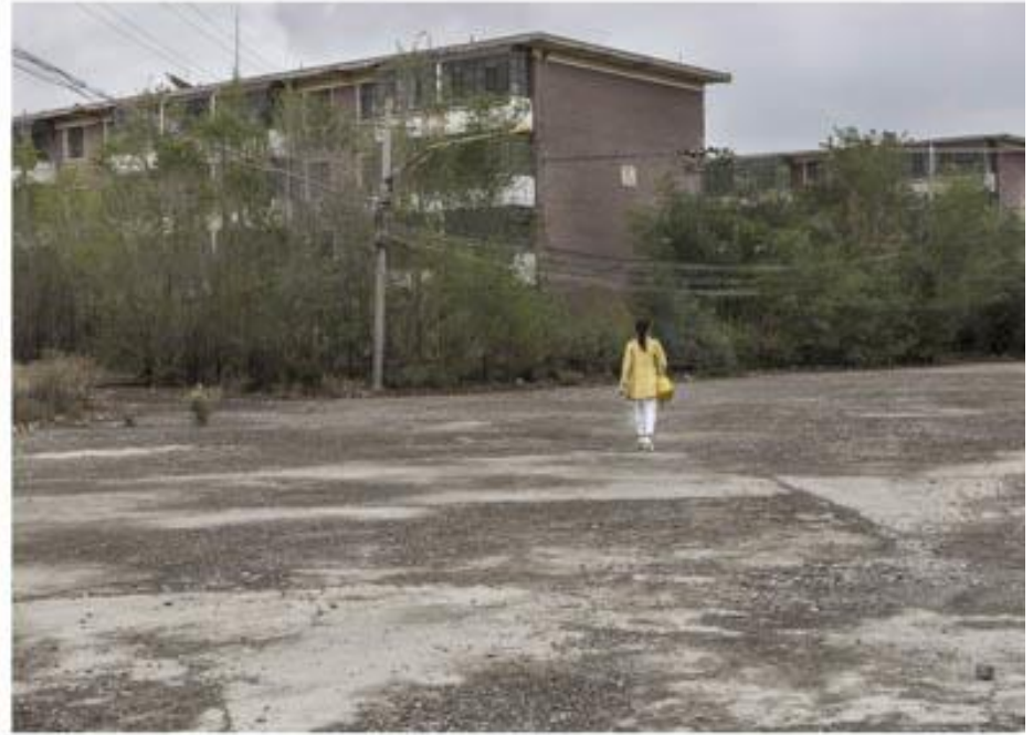
Diptyque 06 – On the site of the old chemical factory, a woman walks towards a building which is said to house a hundred people.