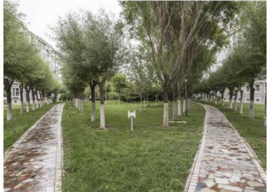
Diptyque 21 – The Yumen oil company’s office block in Jiuquan, the town where Yumen’s former oil workers live now that the wells have run dry. Inside the residence where Yumen’s former oil workers now live.