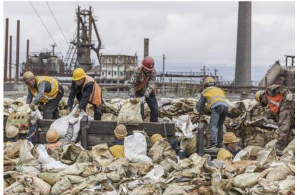
Diptyque 07 – Workers on their way to unload sacks of rocks from a train at Yumen station.