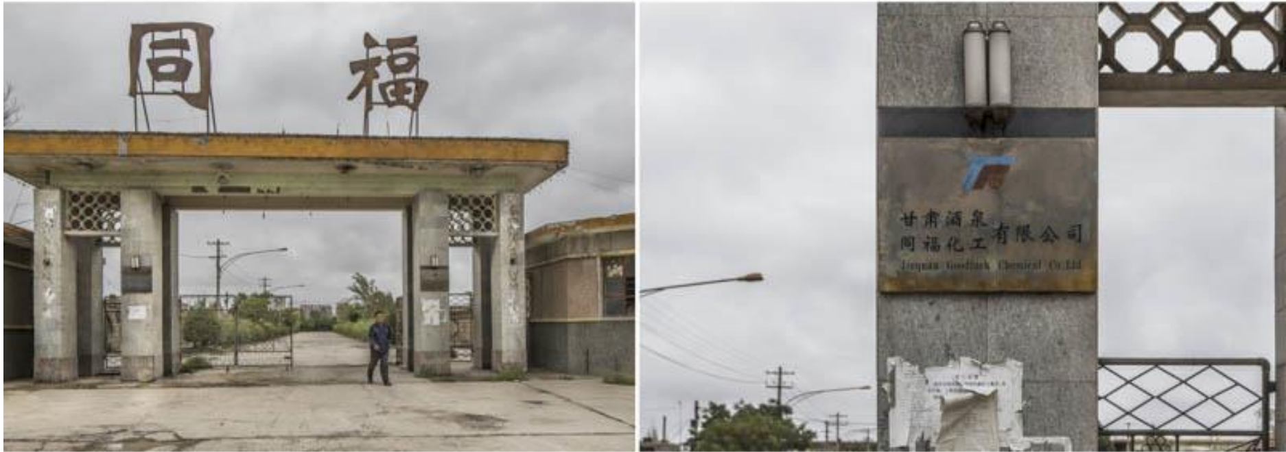
Diptyque 05 – Main entrance to the old chemical factory, Yumen.