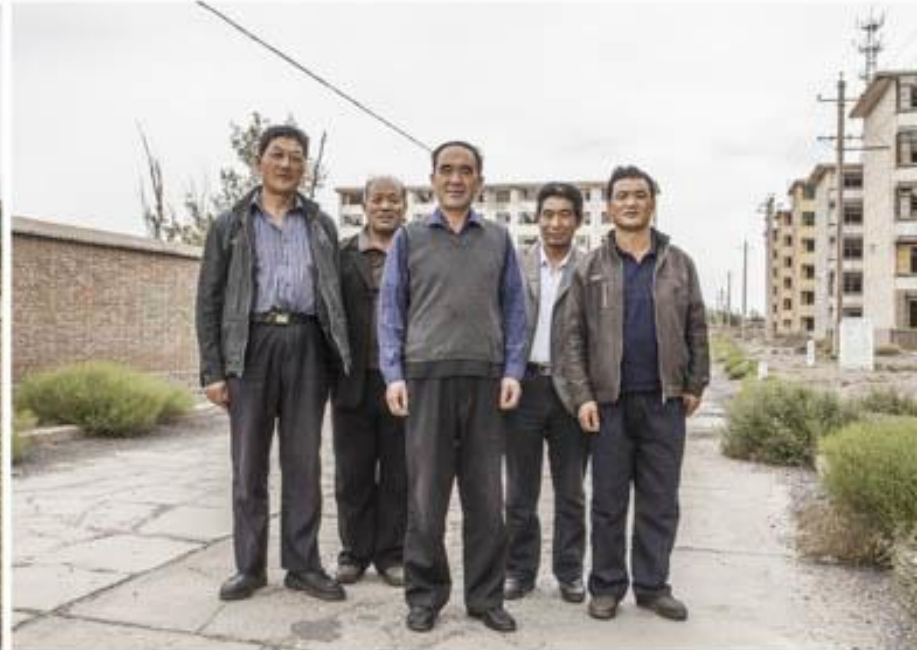
Diptyque 04 – The workers who live for nine months of the year in the abandoned town of Yumen are kept busy with the maintenance of the train station and unloading the freight trains that pass.