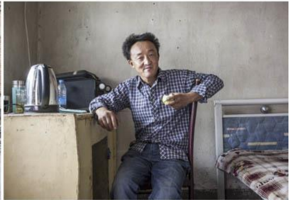
Diptyque 11 – Two workers living for the past two years in the abandoned town of Yumen, posing in front of and inside their dwellings. These are abandoned houses that they have fixed up, where they can live rent-free.