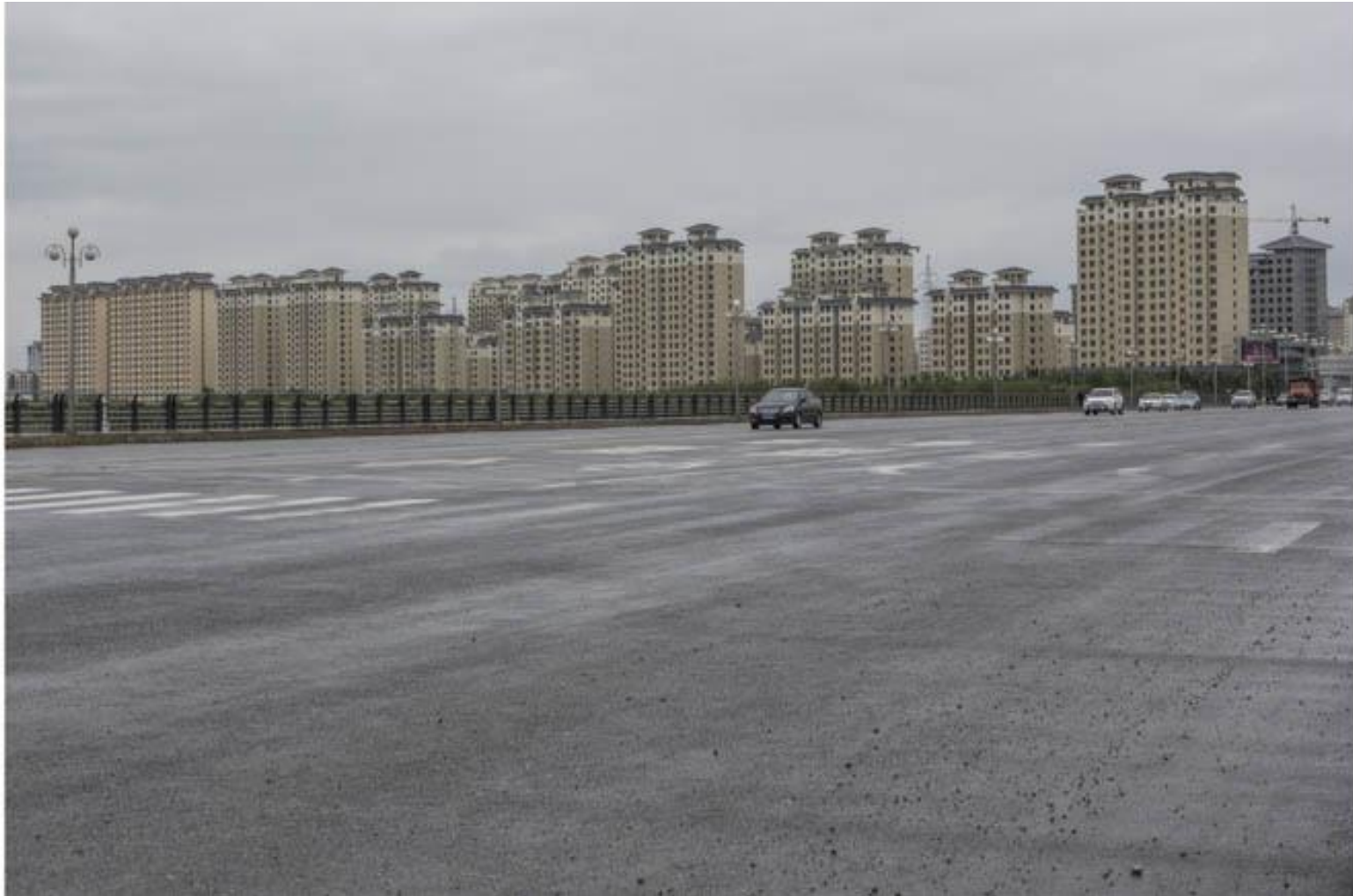
Photo 19 – New blocks of flats on the way into Jiuquan, where workers from Yumen have come to set up home after the oil wells ran dry. Gansu Province, China.