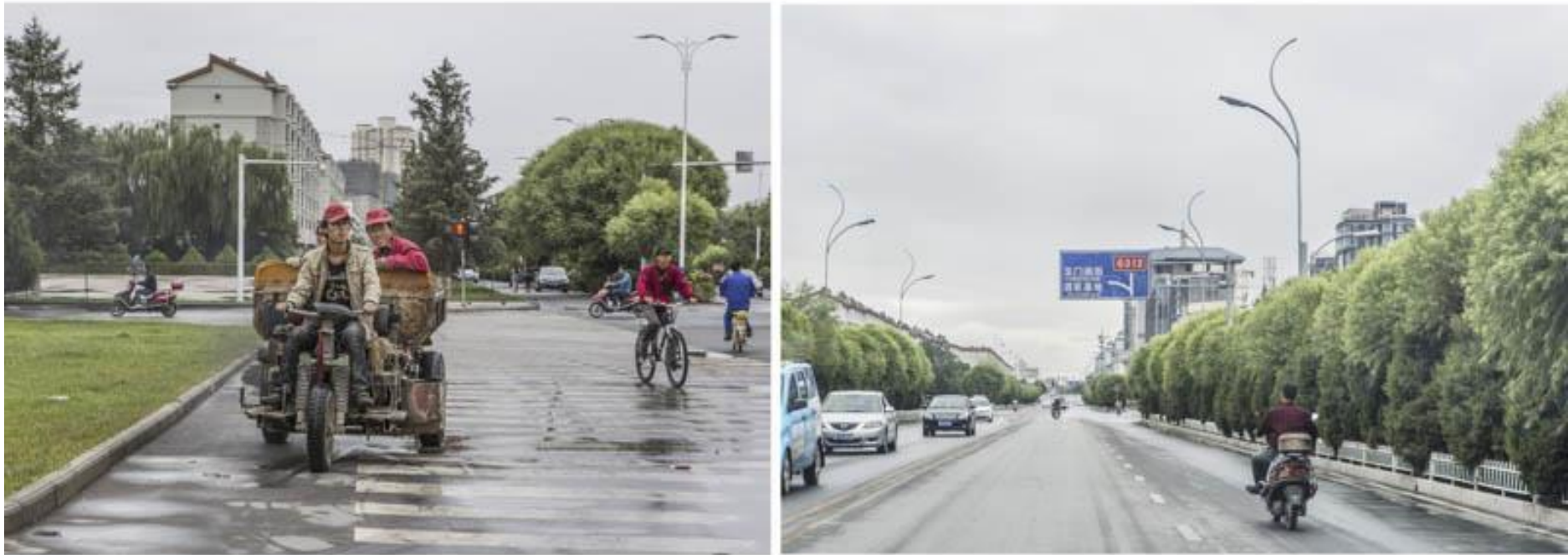
Diptyque 20 – Workers on a motor-tricycle in Jiuquan, a town experiencing a boom thanks to the development of wind farms in the Gobi desert. Road sign showing the direction for the residence of Yumen’s former oil workers.