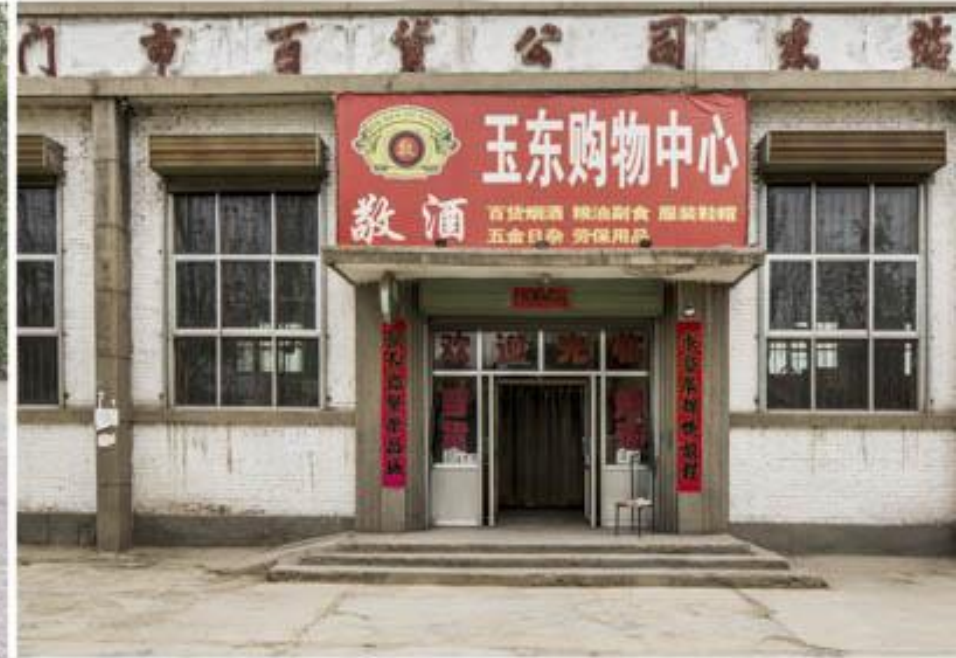
Diptyque 14 – A man exercising in the small park on Yumen's main street. Front of the grocery store-café of Yumen, Gansu Province, China.