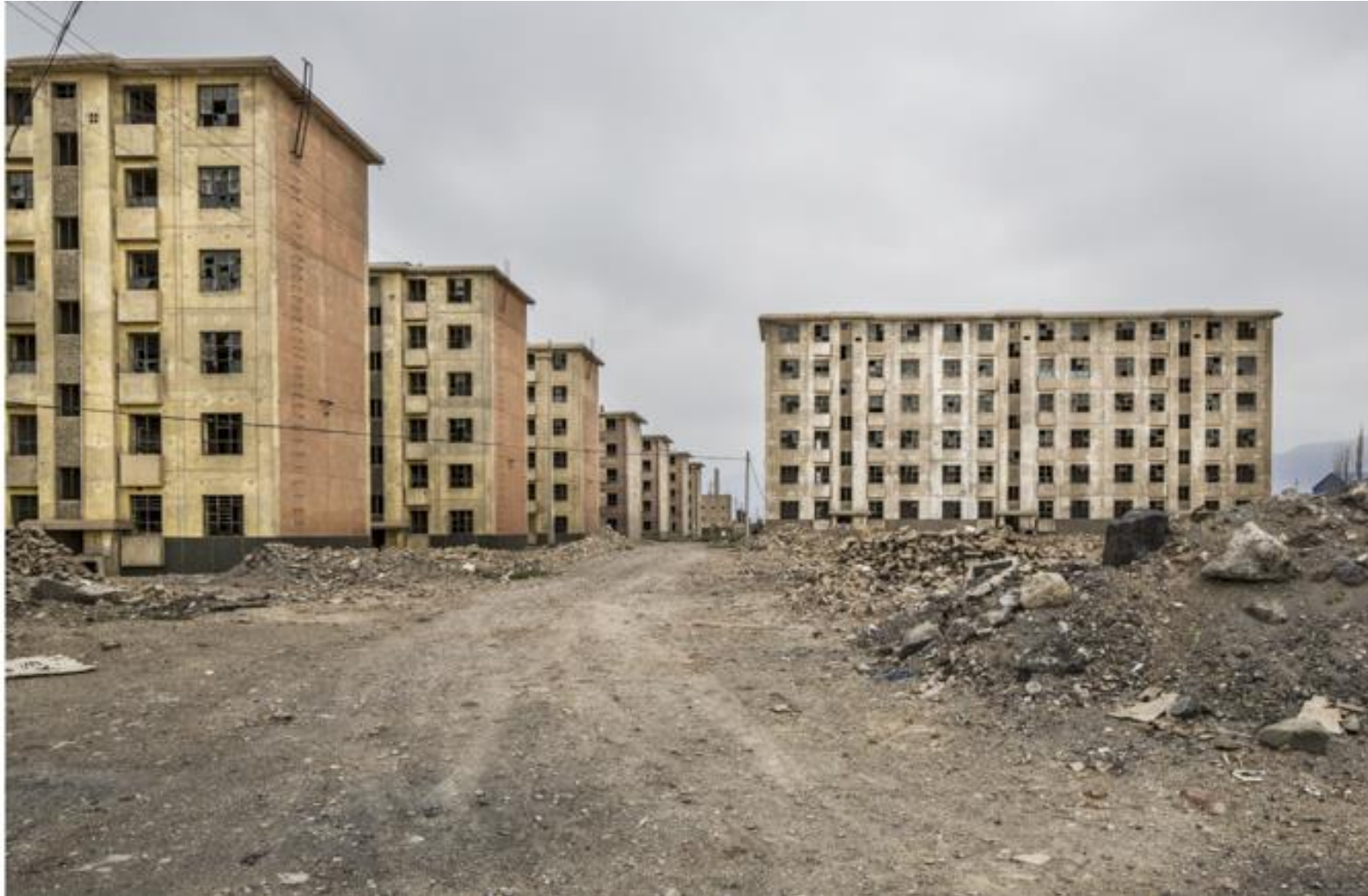
Photo 01 – The abandoned town of Yumen East Country, a former oil drilling town in the Gobi desert.