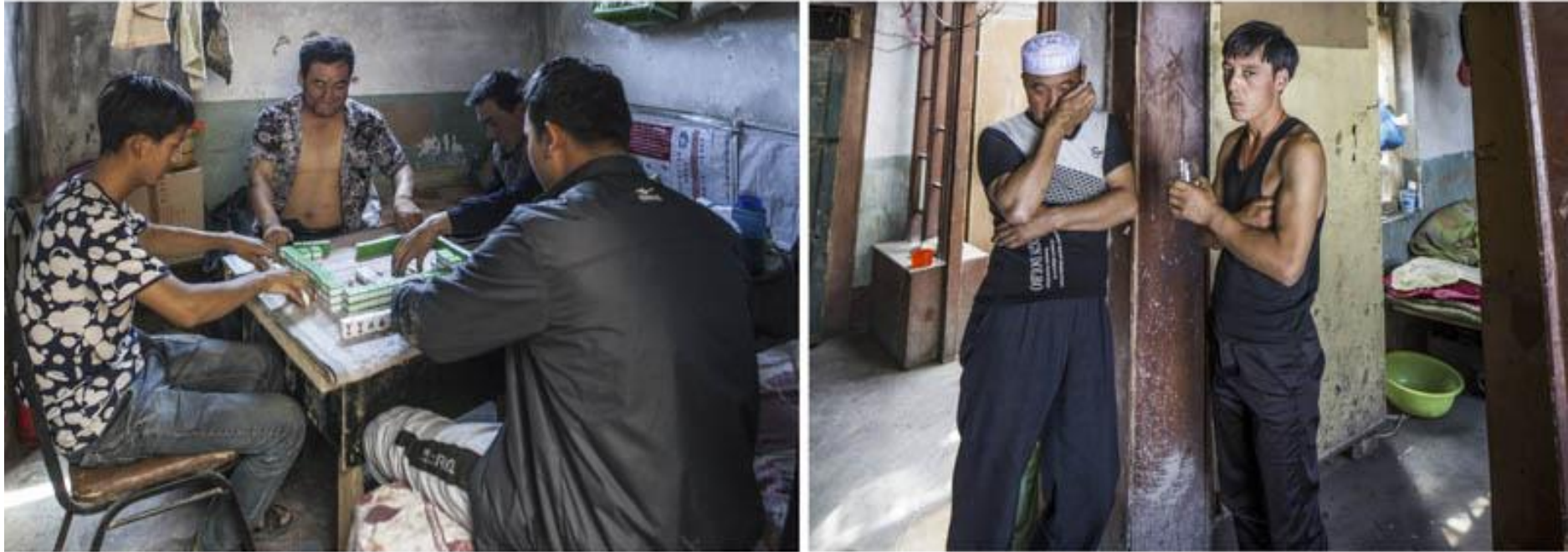
Diptyque 09 – Workers playing mah-jong and others - ethnic muslim Hui – in their dwelling (an abandoned house where they can live without paying rent) in the abandoned town of Yumen.