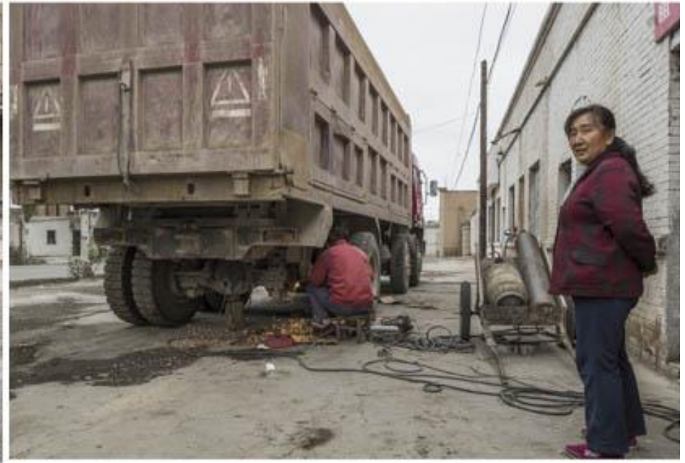
Diptyque 13 – Delivery and sale of melons. A mechanic working on a truck. Yumen.