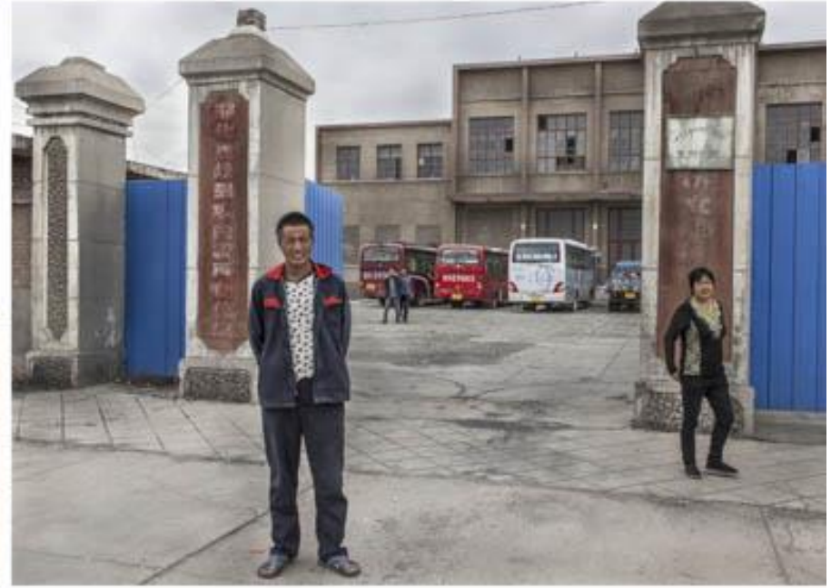
Diptyque 03 – Apartment blocks and workers in the abandoned oil drilling town of Yumen, in the Gobi desert.