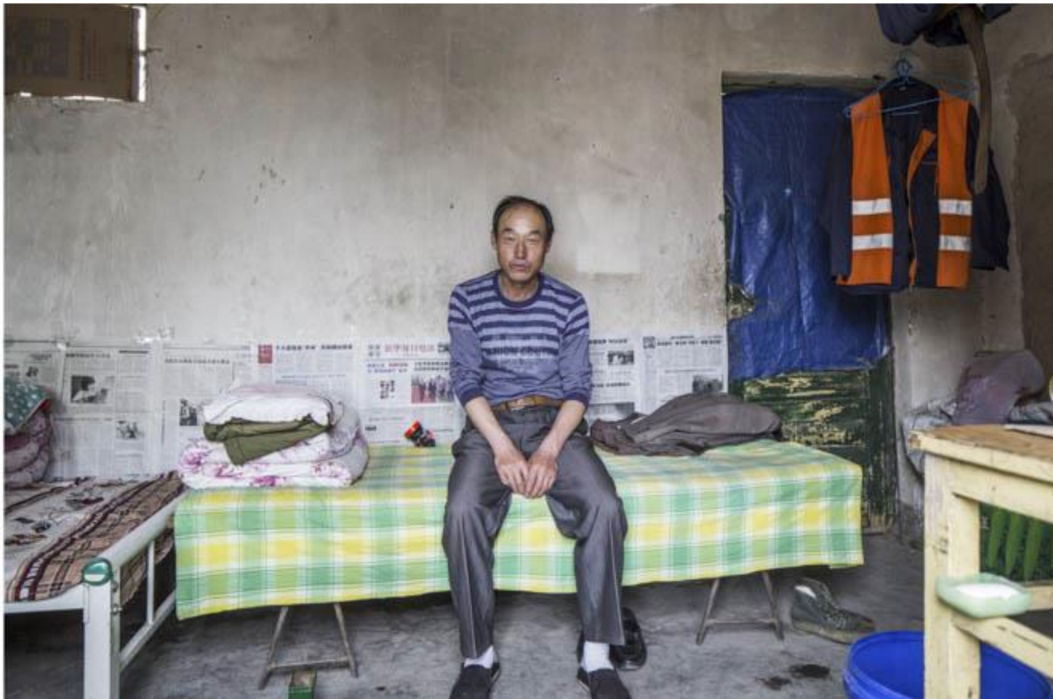
Photo 12 – A worker in the lodgings where he has lived for the past two years in the abandoned town of Yumen.