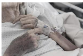
Photo 14 - 15/10/2011 17:31 Martigues city

In winter you like to be at the fireside, you tell me to be careful, I'm a real firebug. « Ah isn't he great! »