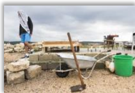
Photo 10 - Since the summer of 2012, some youngsters of the third generation decided to take turns to come live in Iqrit, despite Israel's ban. The young people of Iqrit are always trying to improve their conditions of living, such as by fixing the shelter they built, or by planting trees or repairing the stove. Iqrit, Galilee, Israel. November 1 st , 2014