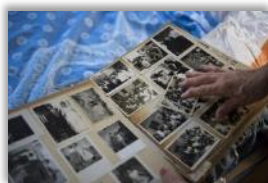
Photo 04 - When the Israeli army entered Iqrit, the soldiers gave two options to the inhabitants: They were told to either go to Lebanon forever, or to Rami, a nearby village for only two weeks. But after they left Iqrit, it was not possible to circulate freely anymore and they were unable to return to Iqrit. Haïfa, Galilee, Israel. October 29, 2014