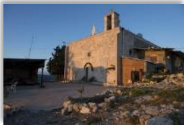
Photo 02 - The church of Iqrit and the cemetery are the only places that were not destroyed by the Israeli army on Christmas Eve in 1951. The Israeli army especially made the "mayor" come to watch the scene. Iqrit, Galilee, Israel. May 14, 2014.

Photo 01 - Yossef is one of the youth who decided two years ago to come back and live in Iqrit to protest on the ground. "Golda Meir said that the 3 rd Generation would have forgotten everything about The Nakba. We prove her wrong: It is not the case". He has the word Iqrit tattooed on his left forearm. Iqrit, Galilee, Israel. May 14, 2014