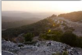
Photo 06 - Georges' parents were living in Iqrit before being evicted in 1948. He is standing where their house stood before being destroyed by the Israeli army. Iqrit, Galilee, Israel. October 25, 2014