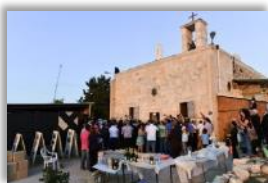
Photo 09 - Each wedding celebrated in The church of Iqrit is the opportunity to party and also to strengthen the ties within the community. Iqrit, Galilee, Israel. October 25, 2014