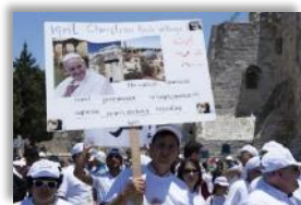
Photo 03 - Members of the Iqrit community came to attend the mass given by Pope Francis, celebrated in Bethlehem. They hope that the Pope will act in their favor following the lunch he will have with Shadia and his family. Bethlehem, Occupied Palestinian Territories. May 25, 2014

Photo 02 - The church of Iqrit and the cemetery are the only places that were not destroyed by the Israeli army on Christmas Eve in 1951. The Israeli army especially made the "mayor" come to watch the scene. Iqrit, Galilee, Israel. May 14, 2014.