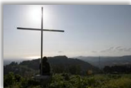
Photo 20 - The remains of the Iqrit village are located in the middle of fields. There are Kibbutzim in the surrounding area where the inhabitants bring their cattle to graze, but the Iqrit community does not hold the property acts. Iqrit, Galilee, Israel. March 14, 2015.