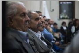
Photo 05 - Members of the Iqrit community are Christians, Greek Catholic. They often refer to their return to Iqrit in their prayers. Iqrit, Galilee, Israel. November 1 st , 2014