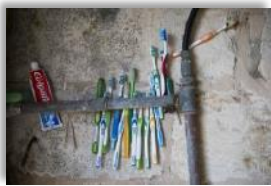
Photo 15 - Over weekends, there are many people at Iqrit: Youth make the best of it to sleep in the village. Iqrit, Galilee, Israel. March 14, 2015.