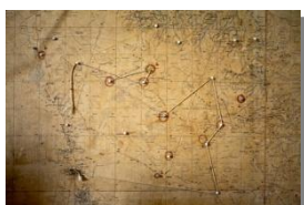
Photo 03 - Sarah, desert postwoman. Map of the northern part of the Northern Territories where the pilots work.