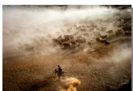
Photo 18 - Farm, Mustering, or gathering of the herd.

From his helicopter, the pilot spots animals crossing the dry bed of the river Flinke. Once the animals are located, he signals their position to the other members of the team on motorbikes or in cars who take over the job of guiding them along the tracks leading to the pen.