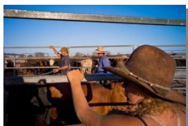
Photo 21 - Farm, Mustering, or gathering of the herd. Once the animals are in the pen, it takes 4 to 5 days to process each of them, one by one. They are tattooed, vaccinated, and their horns trimmed before being sent off to the abattoir or to other grazing areas. They generally spend 4 to 5 years in pasture before being slaughtered.