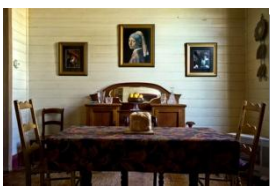
Photo 12 - Gaye and Micke's living room, in the back of the local post office in White Cliffs.