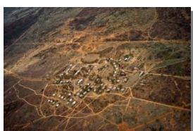
Photo 04 - Sarah, desert postwoman. Flights between farms can be very short – as little as 5 minutes – so Sarah flies at a low altitude, transforming the cockpit into an oven, with temperatures up to 45°C.