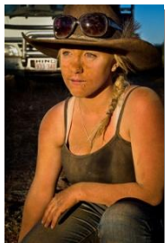
Photo 15 - Farm, Mustering, or gathering of the herd.