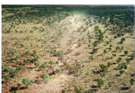
Photo 14 - Farm, Mustering, or gathering of the herd. Encircled by motorbikes, cars and helicopters, the herd of 2500 animals heads for the pen.