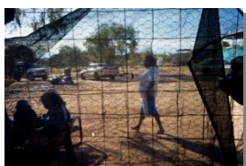
Photo 01 - « Australia is the land of lost children » Frank Ansell.