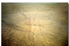
Photo 25 - A watering hole for the animals in the middle of the desert.