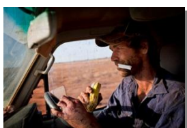
Photo 19 - Farm, Mustering, or gathering of the herd.

Encircled by motorbikes, cars and helicopters, the herd of 2500 animals heads for the pen.