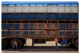
Photo 20 - Farm, Mustering, or gathering of the herd. Farm, Mustering, or gathering of the herd.