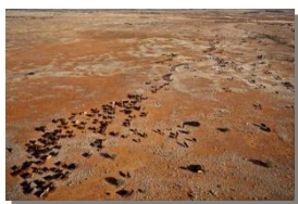
Photo 16 - Farm, Mustering, or gathering of the herd.