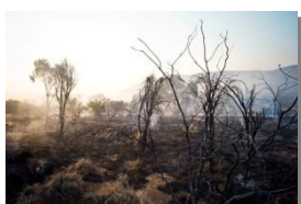
Photo 02 - Bush fire, called Undoolya, meaning “the shade of the wing of an eagle”.