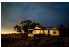
Photo 11 - White Cliffs is a small town of 96 inhabitants, located at the western extremity of New South Wales. This small mining town has a general store where the locals can buy basic commodities. The nearest supermarket is at Broken Hills, 300km away.