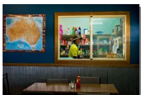
Photo 24 - White Cliffs is a small town of 96 inhabitants, located at the western extremity of New South Wales. This small mining town has a general store where the locals can buy basic commodities. The nearest supermarket is at Broken Hills, 300km away.