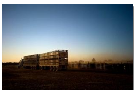
Photo 22 - Farm, Mustering, or gathering of the herd. End of the first day. The road train will do 3 or 4 trips daily for 5 days, between the pen and the farm, with a hundred animals on two floors. The average price, depending on their weight, is 1000 Australian dollars per head.